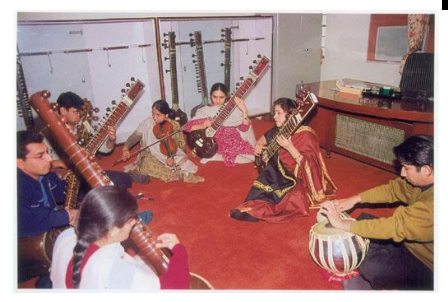
For performances, contact: